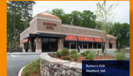
Burton's Grill Westford, MA

In addition to the featured restaurant case study to the left, Navien products are efficiently saving energy and supplying endless hot water to many other dining facilities. A selected group, currently profiting from Navien's technology, is listed below: