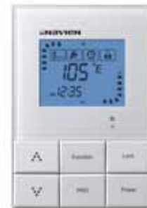
INCLUDED Backlit Remote Controller with Recirculation Timer Function