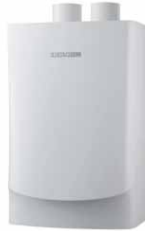
Sleek Design - Compatible with 3" PVC Vent